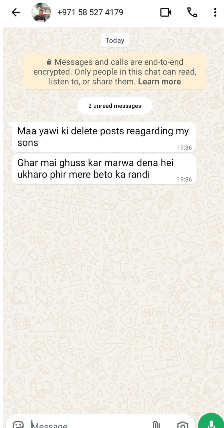
EX-16 — WhatsApp, source post reddit-3.

[profile photo matches the Shakil Bukhari Facebook profile photo] +971 58 527 4179 Maa yawi ki delete posts reagarding my sons 19:36 Ghar mai ghuss kar marwa dena hei ukharo phir mere beto ka randi 19:36