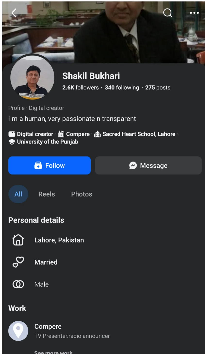
EX-03 — Facebook profile: “Shakil Bukhari”.